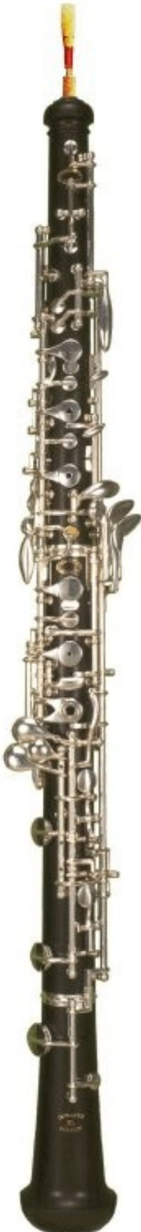
oboe image courtesy Howarth of London

Tel: +44 (0)20 7263 4027 Email: mail@oboeclassics.com Web: www.oboeclassics.com