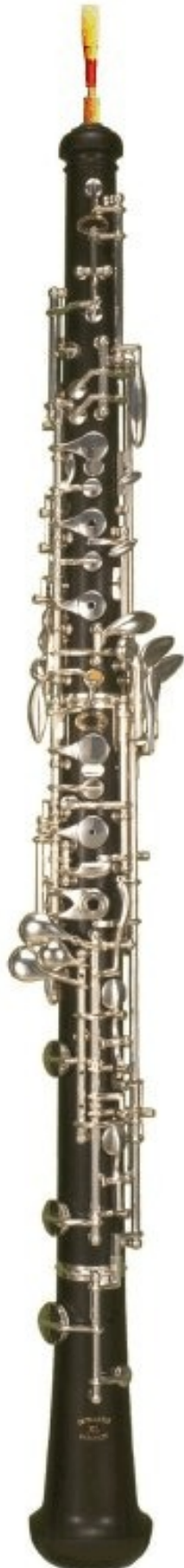
oboe