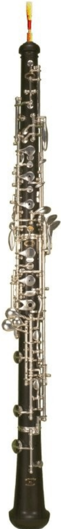
oboe