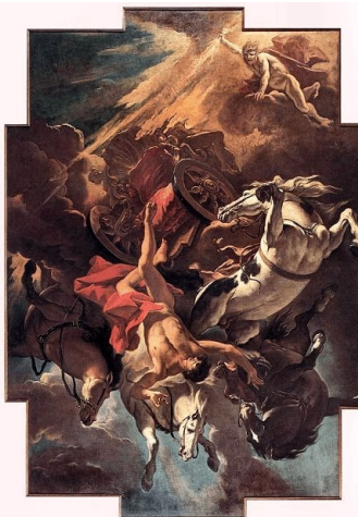
S Ricci, The Fall of Phaeton (1703-4)

This CD has yet to be reviewed, but here are some listener comments: