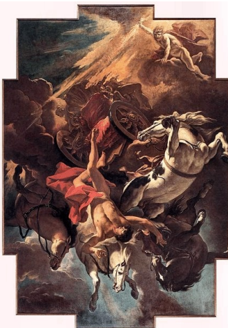
S Ricci, The Fall of Phaeton (1703-4)

This CD has yet to be reviewed, but here are some listener comments: