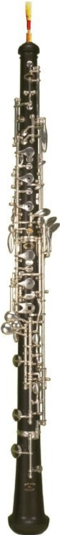
oboe