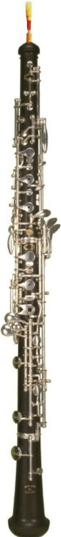
oboe