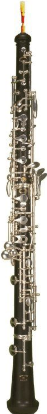
oboe